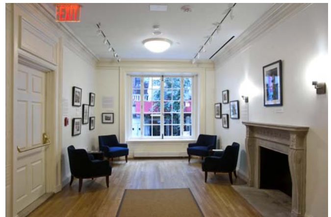
Sara Delano Roosevelt Entryway