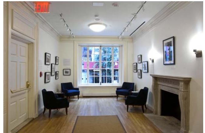
Sara Delano Roosevelt Entryway